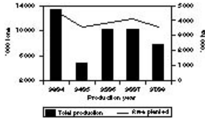
SA maize production (1993/94 to 1997/98)